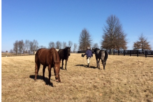
Xavier enticing the ladies to the barn with feed!