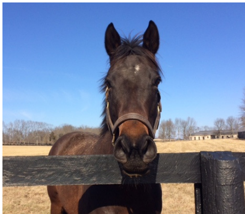
Let's Get Married enjoying her afternoon out.