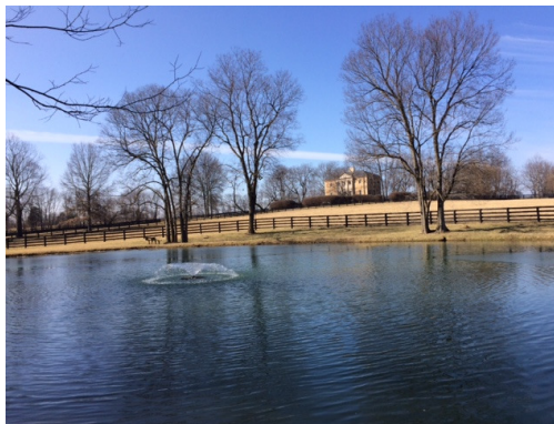
Mare paddocks surround the main residence.