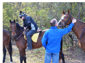
Intermittent & I'll Take That