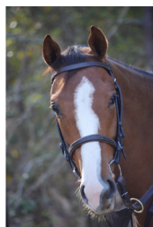
I'll Take That