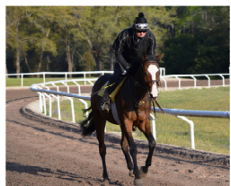
Clear As Day