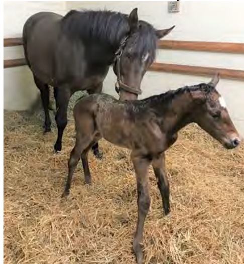
TAKING HIS FIRST STEP!

●CONSCRIPTION foaled a very nice colt (below) by Broken Vow on Mar. 4 th . The mare will be bred to Street Sense at Darley Jonabell.