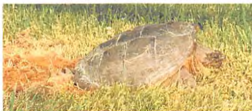
Laying eggs! Will have to watch for babies!!