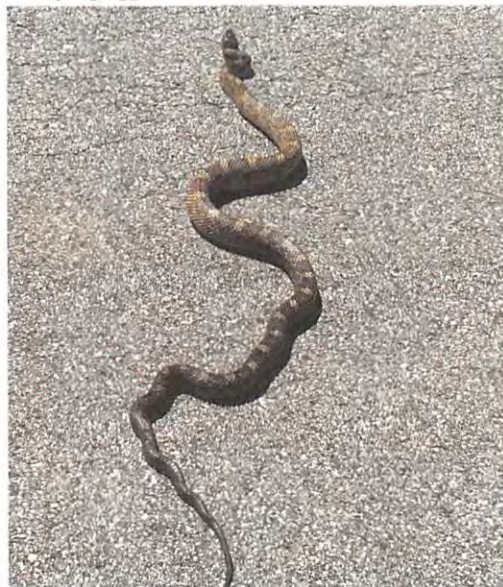
Rat snake? Watch out rats!