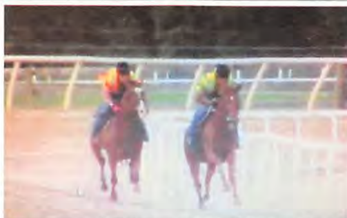
2yos Arbitrary (inside) & Comply , going 3/8's in 37.2 at Fair Hill TC on June 3 rd .