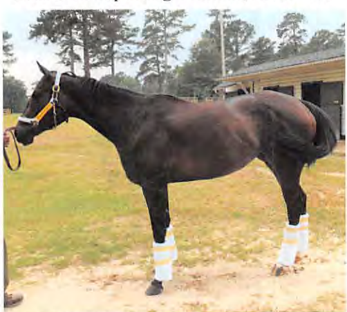
GOOD ALTERNATIVE Kentucky bound.