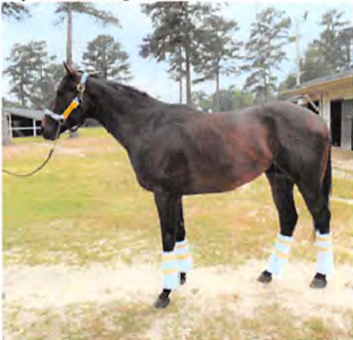
ALL SET departing Camden, SC for KY